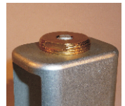
NMO Antenna Adaptor