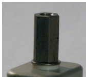
HF Antenna Adaptor 3/8"-24 Thread