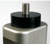
1.5" or 2.0" Delrin Screwdriver Antenna Adaptor