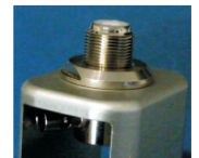
SO-239 Antenna Adaptor