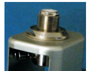
SO-239 Antenna Adaptor