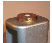
NMO Antenna Adaptor