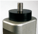
1.5" or 2.0" Delrin Screwdriver Antenna Adaptor